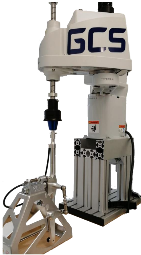
GTSsystem 4 axis Gearshift Control System actuator